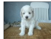
Puppies are here