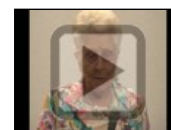
"Trust, Try, Prove Me"