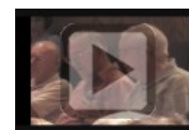
Songs of Deliverance