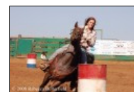
CHSRA Opening Day