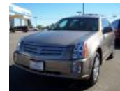
2008 Cadillac SRX-V8